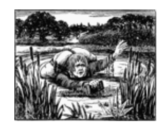
What is a slough?

What is a Wicket Gate? What is his burden?