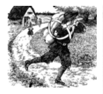
Who does Christian represent?

What is a Wicket Gate? What is his burden?