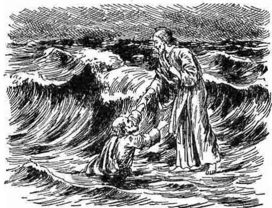
Jesus reaches out His hand to save _____.