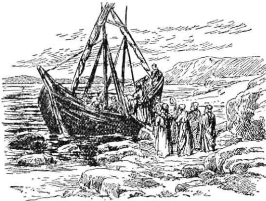
Jesus tells the disciples to get into a _____.