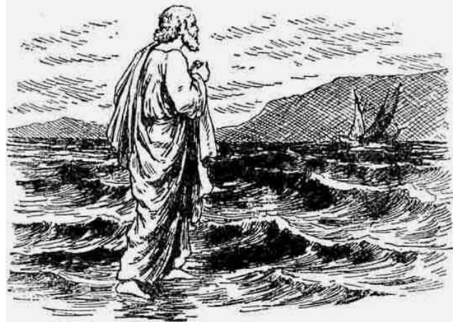
Jesus walked on the _____.