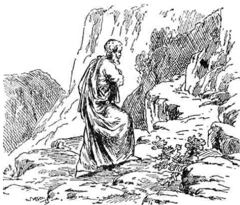
Jesus went up into a _____.