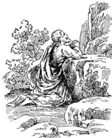
Jesus spent many hours in _____.