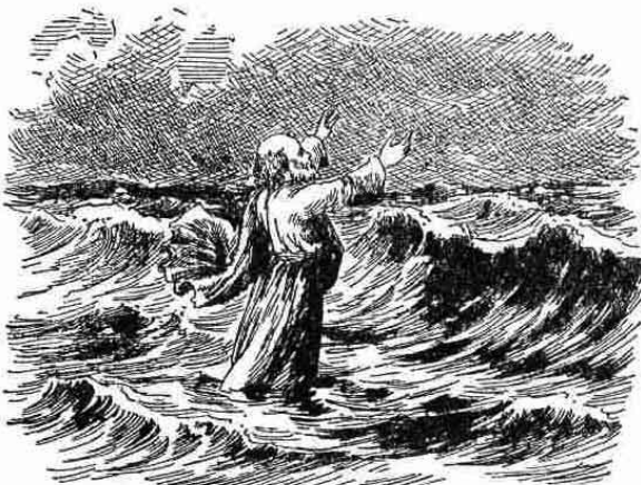
Peter cries for help, because he is _____.