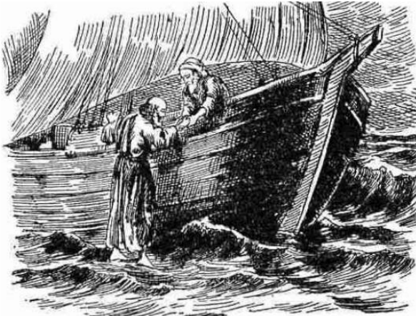
Peter wants to walk on the water to _____.