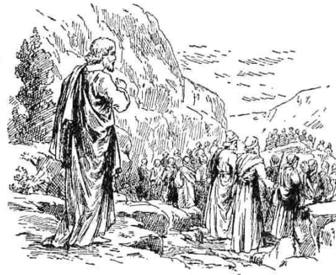
Jesus sends the _____ away.