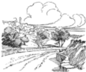
Leaving the city

"God is our refuge and strength, a very present help in trouble." —Psalm 46:1